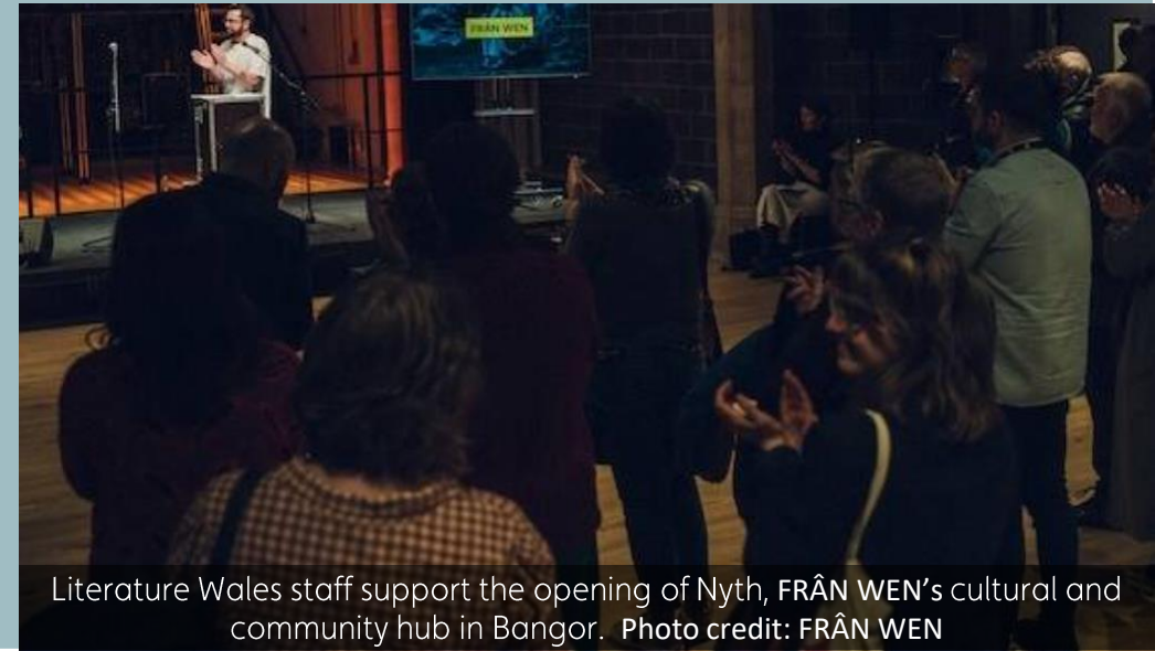
Literature Wales staff support the opening of Nyth, FRÂN WEN's cultural and community hub in Bangor.