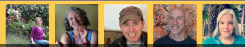
Image shows the ten successful writers on the Reinventing the Protagonist programme.