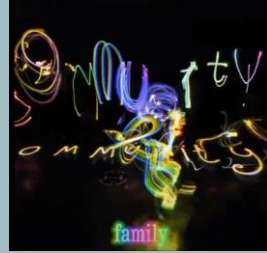
New short poetry film created as part of the Piece by Piece project