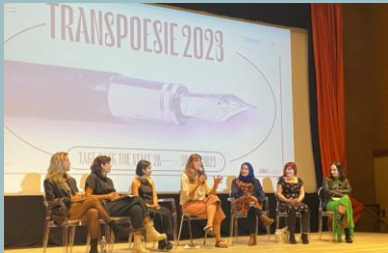
National Poet, Hanan Issa is celebrated at international festival