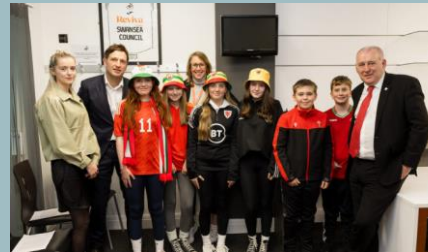
FA Wales supports the call for Welsh-language options on video games.